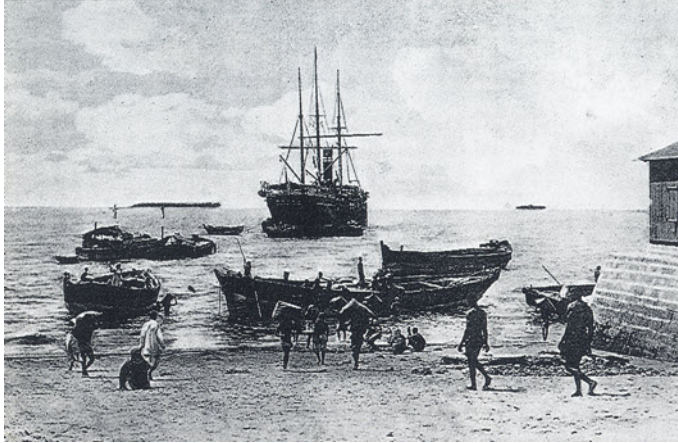
Nerbudda off the beach at Zanzibar

In 1863, proposals were made to the Directors by the Dutch East India Government to take up the mail service of those islands, for which a liberal subsidy had been granted by their Government for a period of ten years, dating from 1866. One of the essential conditions under which the subsidy was granted was that the steamers should carry the Dutch flag. This could not be arranged under the circumstances that the whole of the proprietors and Directors were British subjects; a new Company was therefore formed, under the title of the Netherlands India Steam Navigation Company, with practically the same board of Directors and to a great extent the same body of proprietors. This Company commenced operations in 1866 and has but lately had its contract renewed for a further period of fifteen years dating from 1876. It now possesses a fleet of 23 steamers aggregating 20,000 tons, trading from Java to the different ports in the Eastern Archipelago. At the present time six of its steamers are engaged by the Dutch Government as