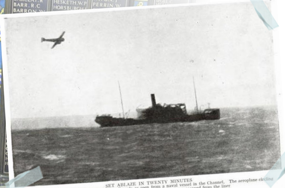
SET ABLAZE IN TWENTY MINUTES Still burning after the merciless attack, the Domala as seen from a naval vessel in the Channel. The aeroplane circling round the vessel is searching for survivors who may have escaped from the liner.