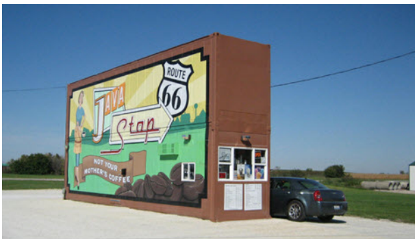
Coffee boxes: the way to go? Two 40 footers adapted as an espresso stop at Dwight, Illinois

The great thing about using containers in this way is that they are inherently transport-proofed and transport-friendly. They can be moved cheaply and quickly with minimal damage from a construction plant to, say, a