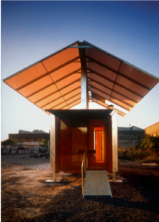
Futureshack - temporary home in a ship's container

The fact that shipping containers are not just incredibly strong and transport-proof but also come fully marinated makes them ideal for emergency relief. Simple but robust housing, hospitals, and workshops can easily be created from the standard 8 x 8 x 20 foot module.